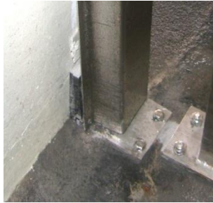
Compact Guide Design