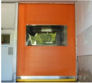
MAX Doors FoodSafe TOUGHFLEX ® door curtain