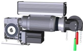
240v Single Phase GfA Safedrive