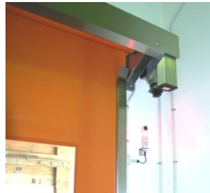
Durable stainless steel construction