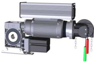
240v Single Phase GfA SafeDrive®