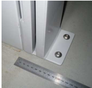
Compact Guide Design