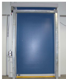
Durable solid steel construction