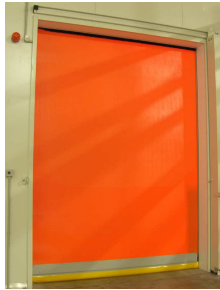
MAX Doors TOUGHFLEX® door curtain