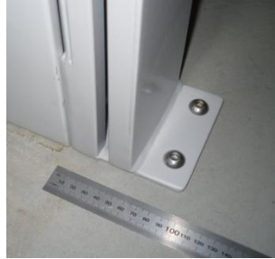
Compact Guide Design