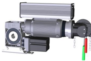
MAX Doors ISO-FLEX™ door curtain 240v Single Phase GfA SafeDrive®